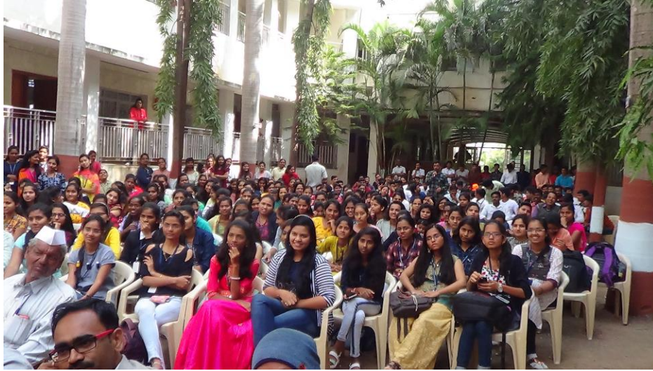
Students and Staff enjoying Annual Gathering