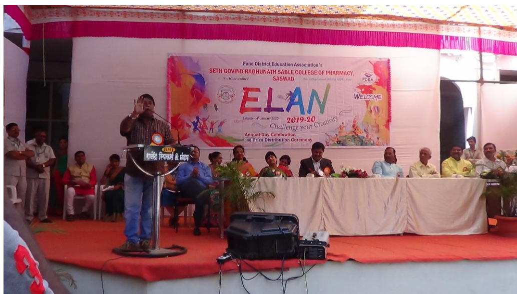
Chief guest Hon. Shri Jaywant Wadkar, Film actor addressing the audience